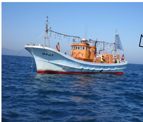
Fisher Boat with freezers